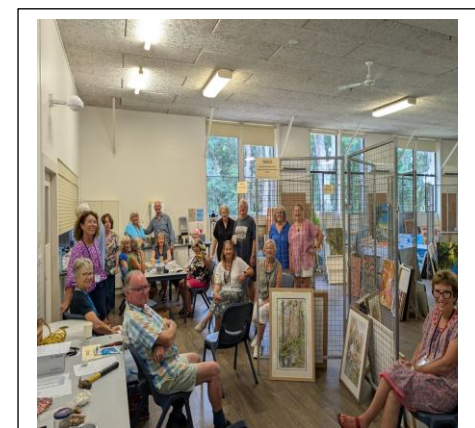
Our team taking a break from assembling the display