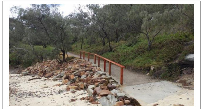
Path to Bartlett's Beach