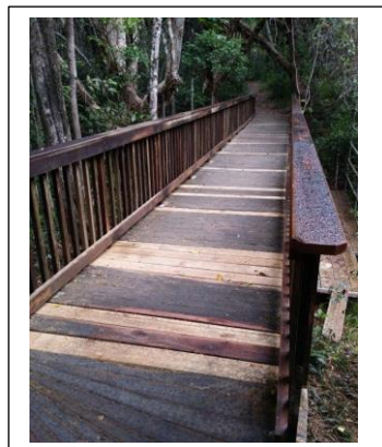
Spooney's foot-bridge to Bartlett's Reserve

If you are interested in nominating for Committee, applications need to be received by Tuesday March 13 th 2018.